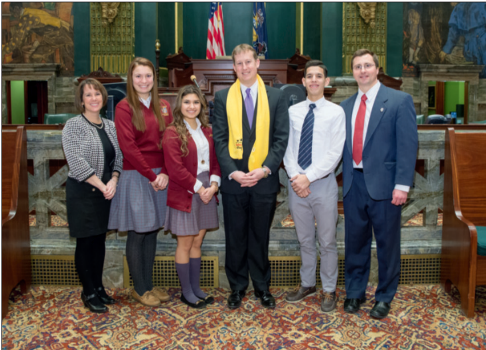
Lancaster Catholic: Students from Lancaster Catholic High School recently visited the Capitol to present me with a certificate for my support of the EITC scholarship program. The program is a great example of what can be accomplished when government and local businesses partner with the education community to improve learning experiences for students.

I also plan to provide regular email updates on legislation of note and items of local interest. If you are interested in signing up for e-news updates, I encourage you to visit my website and enter your name and email address under the "Sign Up for Updates" heading.